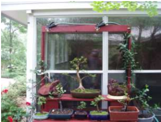
Completed work stand