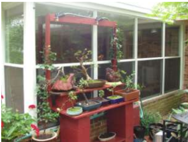
Completed work stand