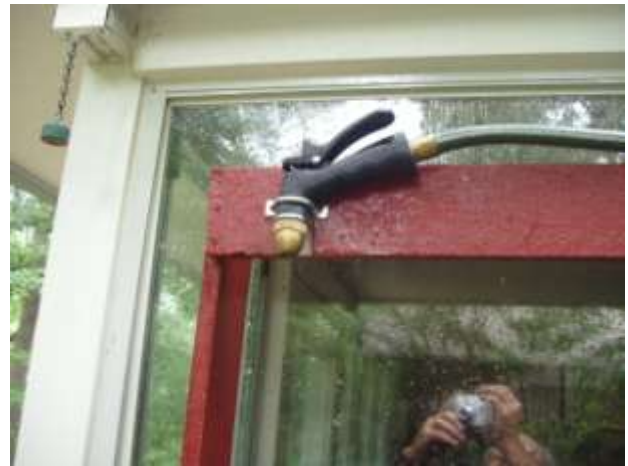
Close up of sprinkler heads